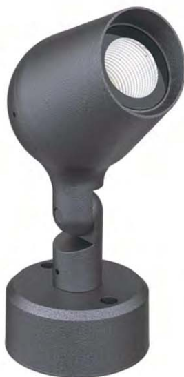
SB Surface Base Mount IMP-002