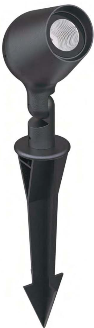
GS Ground Stake IMP-001

Whether lighting up a tree from below or hanging a fixture from it, to using a ground spike, pole clamp or yoke arm, there is a mounting solution to suit every application.