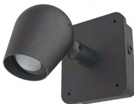
WM Wall Mount(USA) IMP-005