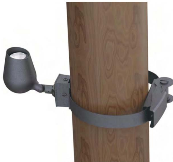
TM Tree Mount IMP-003