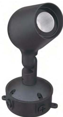
JB Junction Box IMP-004